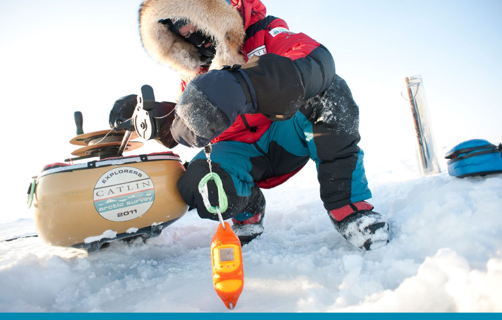
Researchers from the Catlin Survey team deploy a lightweight CTD under Arctic ice to trace effects of melting ice and warmer temperatures.