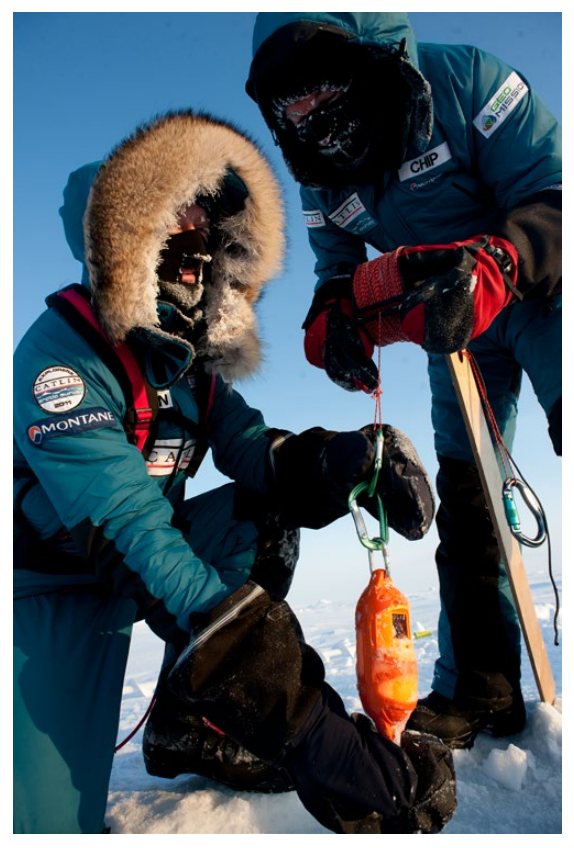
The SonTek CastAway-CTD is so compact it can be kept warm before deployment by simply tucking it inside the explorer's jacket.